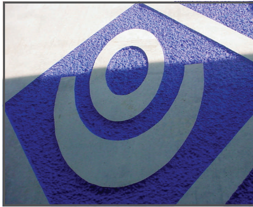
Detail of signage

Precast concrete offers many benefits to warehouse designers including fast construction, clear interior spaces in which to stock products and inherent fire resistant panels. The warehouse features 345 wall panels, 224 of which are insulated or energy efficient “sandwich” panels.